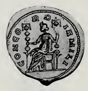
Lot No. 2070